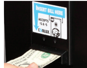
Premium Currency Acceptors Includes standard electronic coin acceptor and $1, $5, $10 & $20 bill acceptor. (Factory set for $1 & $5)