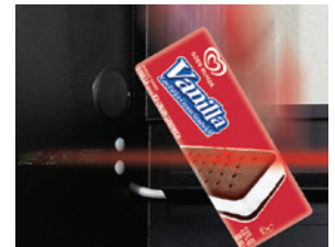
iVend® Guaranteed Delivery System Keeps customers satisfied and reduces service calls for misloaded product.