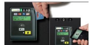
Credit/Debit & mobile reader options.