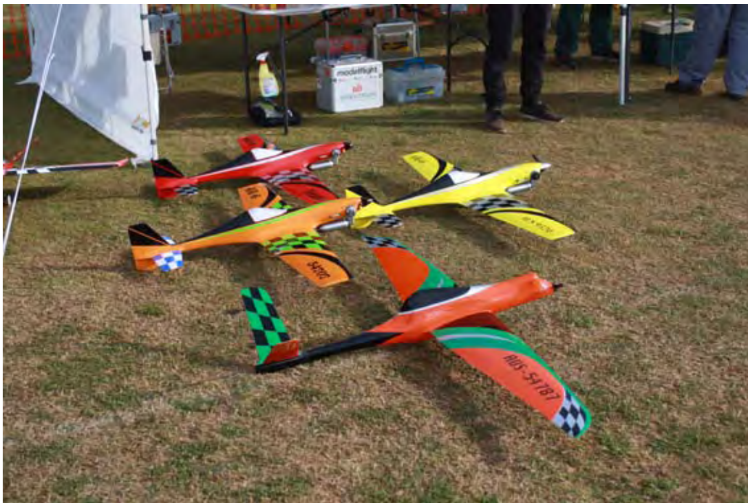
More photographs page 11