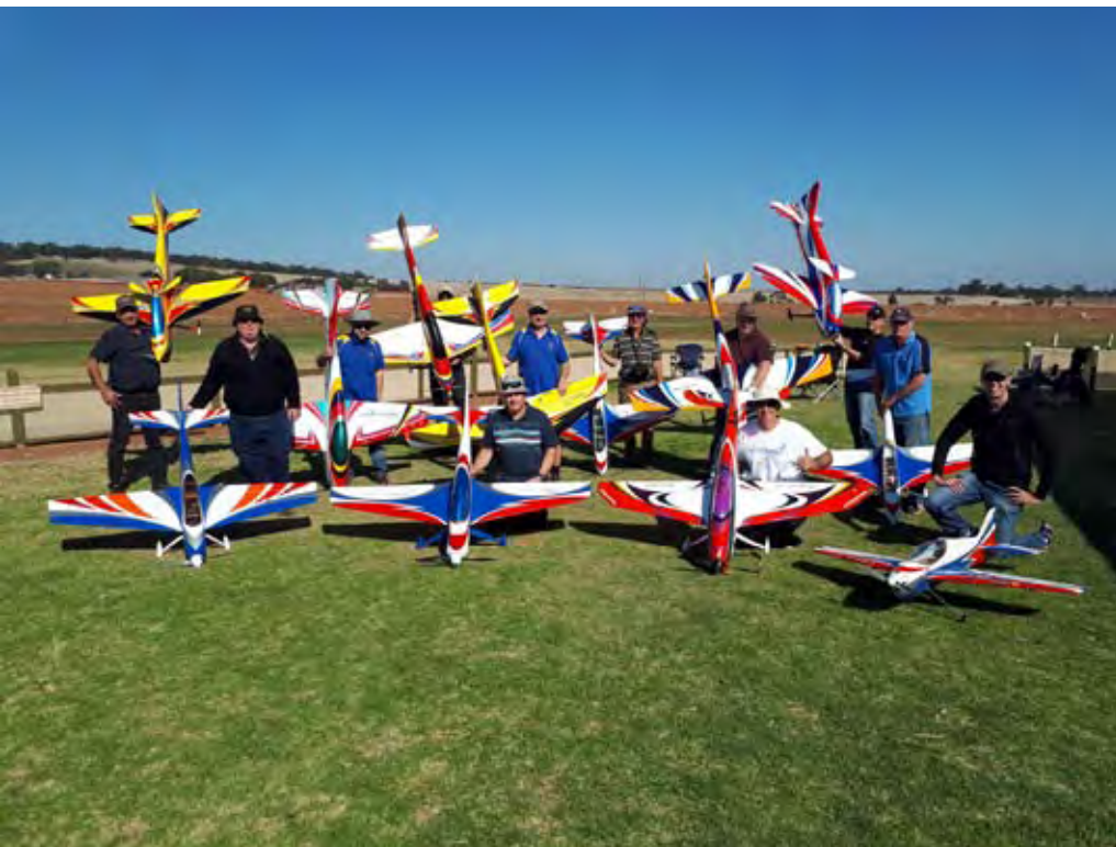
The line up at SkyHawks