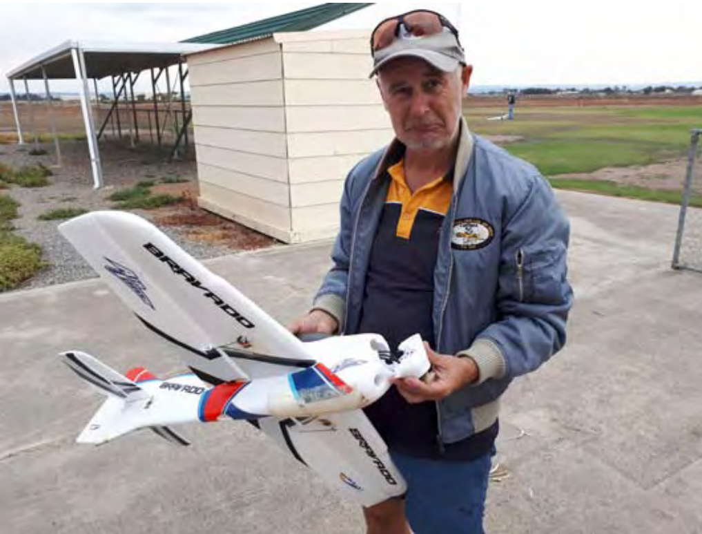
JT proving that occasionally even he makes a mistake!