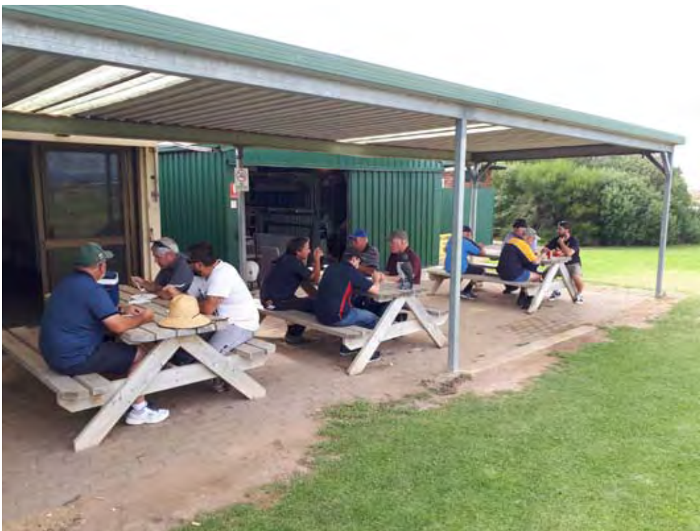
Everyone enjoying lunch at Connie