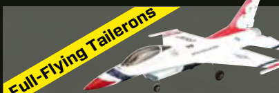
UMX F-16 BNF BASIC (EFLU2850)