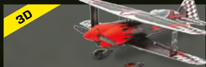
UMX P3 REVOLUTION BNF BASIC (EFLU5050)