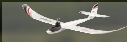
UMX™ RADIANT™ FPV BNF (EFLU6780)