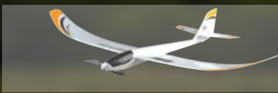
UMX™ RADIANT™ BNF BASIC (EFLU2980)