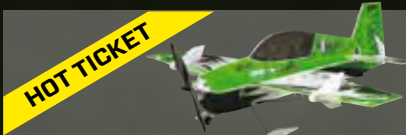
UMX AS3XTRA BNF BASIC (EFLU5150)