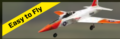
UMX HABU S BNF (EFLU4380)