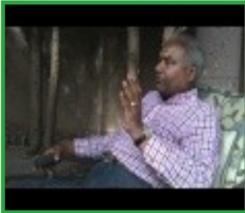
"My Father, My Father" Trailer