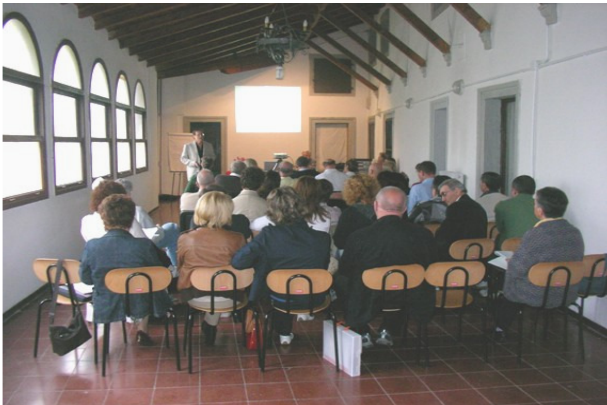
Main meeting room