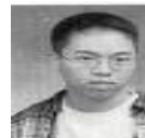
Seung-Hui Cho, 23, South Korea