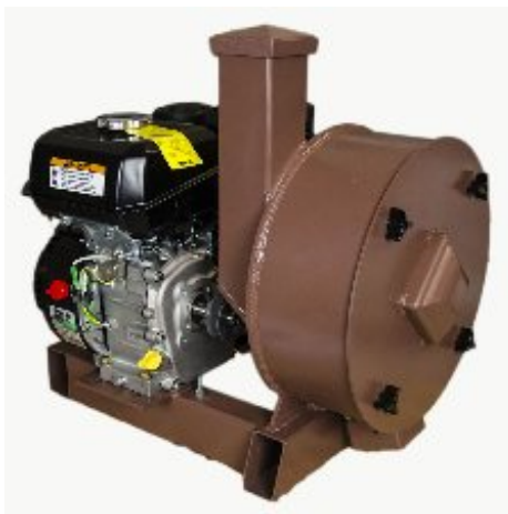
14" Crusher with gas motor

Rocks are rocks unless they contain valuable minerals, metals, or elements. When a rock has values in it, it's then called ore. In order to liberate the minerals, it needs to be crushed down. In days of yore, a stamp mill was the primary form of crushing rock, but in the modern world, there are more choices— from hand-held sampling crushers like the Cobra Crusher , to those with gas or electric motors. Each has its own pros and cons -- and price tag. Whether you want to turn rock into talcum powder or