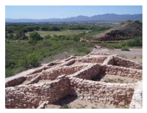
Toozigoot National Monument

and Montezuma was never there (early explorers and settlers mistakenly thought the Aztecs had built it), the five-story cliff dwelling is certainly majestic. Perched 100 feet above the valley floor, the 20-room fortress is still 90 percent intact, and one of the finest cliff dwellings in the country. Although visitors are no longer permitted to go up into the ruins, Montezuma Castle is easily observed from the park's paved 1/3-mile loop trail, which also meanders through a sycamore grove and along Beaver Creek, one of only a few year-round streams in the state. Interpretive signs along the walkway describe the Southern Sinaguan way of life. Also spend some time inside the visitor center at Montezuma Castle. Beautiful pottery and textiles are displayed, along with other artifacts. Listen in on a ranger program, or join a group walk to learn even more.