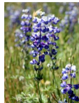
Lupine covering the grounds earlier this year