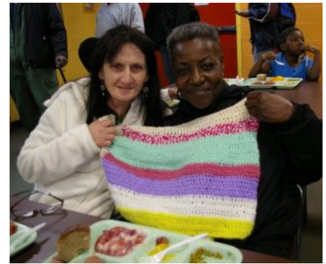
Prayer Shawls given out in Chicago by SVPC Youth on their Spring Break Mission Trip.

My biggest challenge is to keep the program alive by recruiting new people to share in our ministry. Our group meets at 9:00 on Tuesday mornings at the church in the Chapel. Some women crochet or knit at home, too. We encourage more to join in this mission."