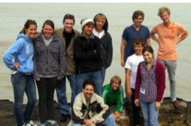
SVPC Youth in Chicago

Jr. High winter retreat – I will be planning a winter retreat for our Jr. High students during the 2012 February break.