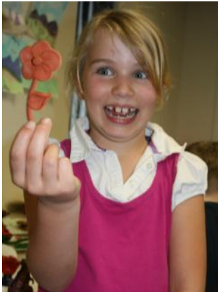
Kingdom Crew Art Program produced many different types of art forms and hosted an art show and silent auction.

Greeting from the Children's Ministry Team. We feel so privileged to help support and serve the many ministries and programs that affect the children and families at Sierra Vista.