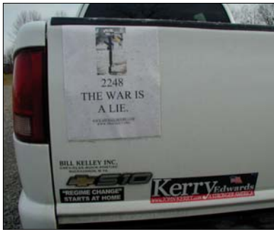
A sign to remind everyone of the human cost of the Iraq War.

Most people aren't thinking about the war on a daily basis. To remind them, and make them think about what it means, I have been displaying the count of soldiers killed in Iraq on my truck since Veterans Day. I found a picture of a helmet on a rifle in Google Images, pasted that into a Word document, and in 72 point type, put in the number of dead of the day from www.michaelmoore.com , followed by The War is a Lie, and in smaller print on the next two lines, www.michaelmoore.com and www.truthout.com , (that's all that will fit on one page) in case anyone wants to know more, because they sure won't find out by reading the Clarksburg Exponent-Telegram. Then I saved the document and printed it. The number can be changed whenever you want to update it. When I do, I add 10 to the daily number so it will be close to right longer. Nobody who sees it will know if you're off a little.