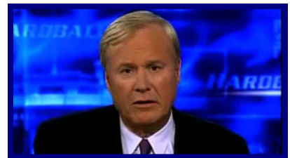
Misinformer of the Year, Chris Matthews