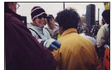
Cindy Sheehan at the March.