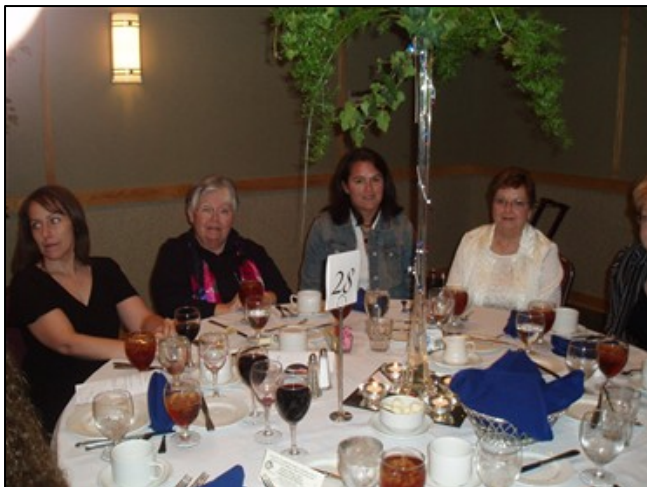
The DFA table at the Regional Jefferson-Jackson Dinner.