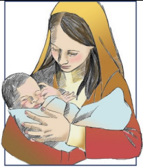
“Emmanuel, God with Us!” Wonderful Counselor, Prince of Peace, Mighty God.