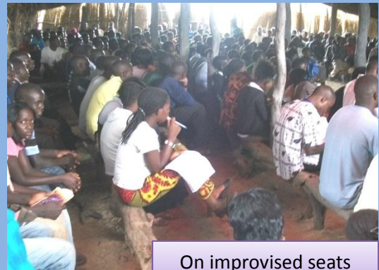
On improvised seats

Just as everybody was enjoying the evening Bible class on Friday (April 22), a tragic accident occurred and a nine-month baby was killed. One of the improvised seats (a long sitting on Y-shaped poles) gave way to weight of the people and collapsed on the baby sleeping on the ground. The baby was rushed to the nearby clinic where he was pronounced dead on arrival. As a result of this tragedy, the house-to-house evangelism program planned for Saturday was cancelled as everybody went to the funeral house until the baby was laid to rest on the same Saturday (April 23).