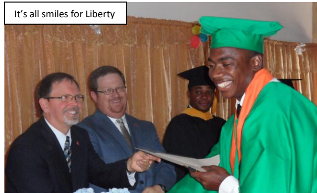
It's all smiles for Liberty

What a colorful graduation ceremony we had when 60 graduates walked down the aisle on September 2, 2011! Indeed we had 41 graduates in the Spiritual Formation program, 14 in the Bible & Ministry program, and 5 in the Missions program. The first two programs are certificate programs while the last one (Missions) is a diploma program. So the