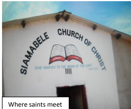
Where saints meet

After spending four tireless days of evangelism and counseling, eighteen (18) brethren were restored to the Lord and six (6) were baptized. Most people (especially women) confessed of being actively involved in witchcraft. They believed that you cannot survive in the adult world without the help of charms and other unholy concoctions. After much exhortation from the word of God, their faith in God was revamped and their trust in Christ enhanced.