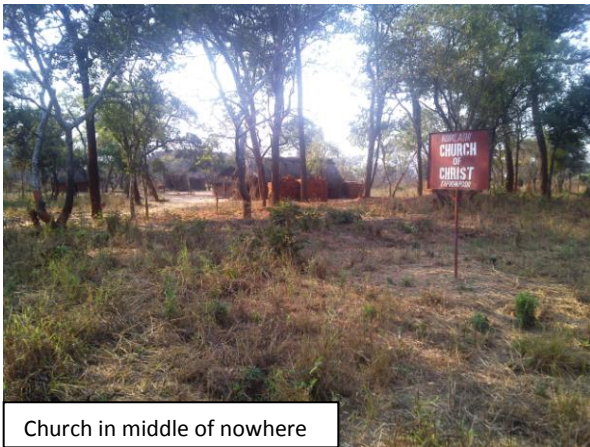
Church in middle of nowhere

Faced with the ever mushrooming number of small churches in central Zambia, we have thought it wise to “take the school to where the people are”. As such I spent the big portion of the first two weeks of August in Serenje (Central Province) trying to acquire a piece of land on behalf of Mapepe Bible College from the local government in the area. Fortunately, our persistent request was honored and we have been approved to hold land in Serenje.