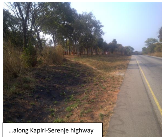
...along Kapiri-Serenje highway

We do have several Mapepe graduates who live and work in Central Zambia. These graduates have been busy in the Kingdom as can be attested to by