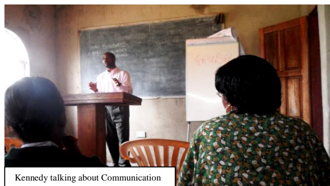
Kennedy talking about Communication

With a continued rise in divorces among Zambian couples, we decided to come up with a way of strengthening marriages in our congregation. It’s abundantly clear that most divorces in Zambia happen between the first 15