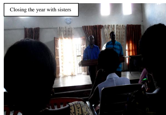
Closing the year with sisters

Sometime in January (specifically on January 8) the Lusaka Christian women organized a meeting to welcome the then new year and stated their goal as “possessing our possessions” taken from the book of Obadiah 1: 17. I was privileged to be the one to officially open their gathering with a lesson from Obadiah on that day. Well, I was again asked to close their year with the “you have to finish what you started” statement. I was