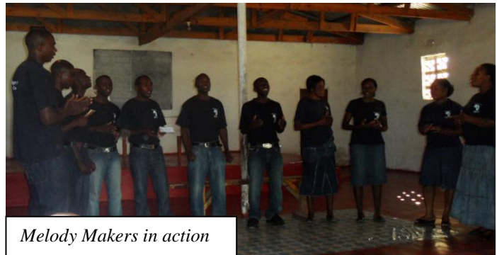
Melody Makers in action