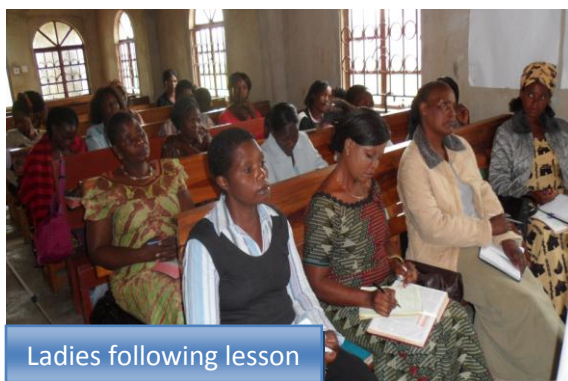
Ladies following lesson