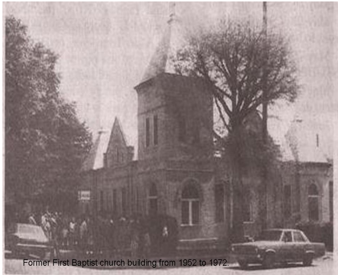
Former First Baptist church building from 1952 to 1972.