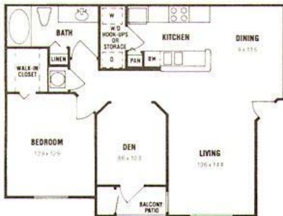
1 and 2 bedroom options Floor plans vary based on availability

Nika Corporate Housing at Camden Westshore offers recently renovated spacious one and two bedroom apartment homes with black appliances, new cabinetry in the kitchens, modern light fixtures and ceiling fans, and much more! Our community features an Olympic-size swimming pool and spa, fitness center, car wash facility, and boat parking. This pet-friendly community is conveniently located in South Tampa near the Crosstown Connector which is just minutes from fine shopping, dining, and entertainment.