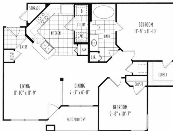
1, 2, and 3 bedroom options Floor plans vary based on availability

Relax...We have it covered. Nika Corporate Housing's offers luxury living at the gateway of downtown St. Petersburg, South Tampa, gulf beaches, I-275, airports and shopping. Our elegant Key West inspired homes provide carefree living with personalized service. You'll be surrounded by natural beauty & vitality.