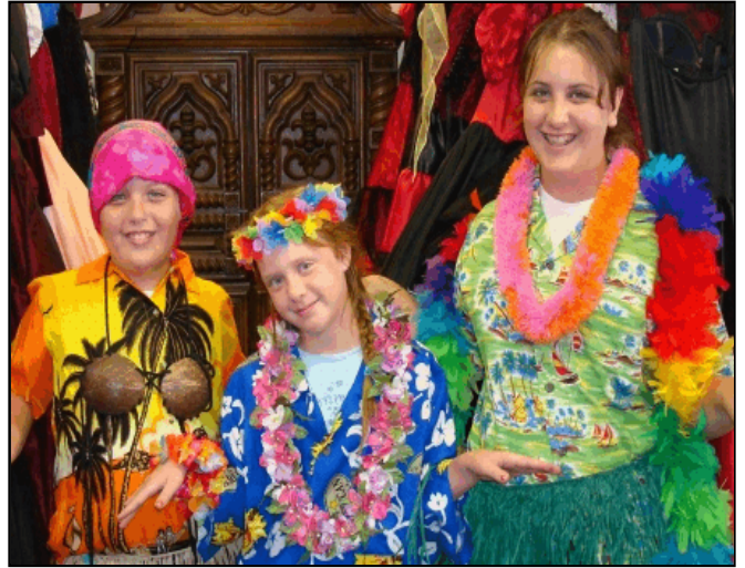
What kid doesn't love a parade & 'dressing up'!

You don't want to miss out on this year's encampment program. Come enjoy every detail of this marvelous vacation and spiritually packed week. Take our word for