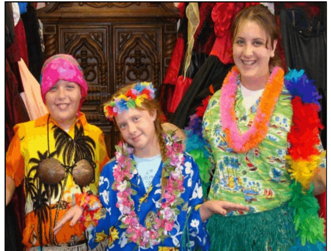
What kid doesn't love a parade & 'dressing up'!

You don't want to miss out on this year's encampment program. Come enjoy every detail of this marvelous vacation and spiritually packed week. Take our word for