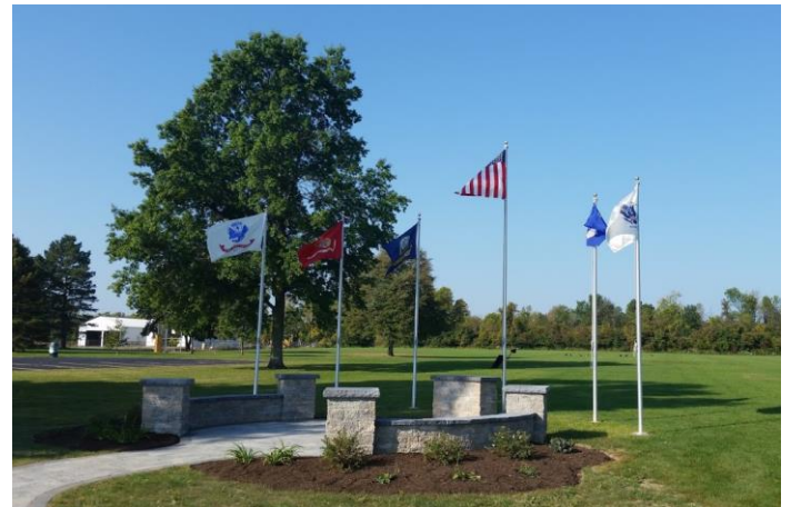
Veteran's Memorial at Town Park

Meeting dates, times and locations are subject to change. Please check with the Town Clerk's office to confirm.