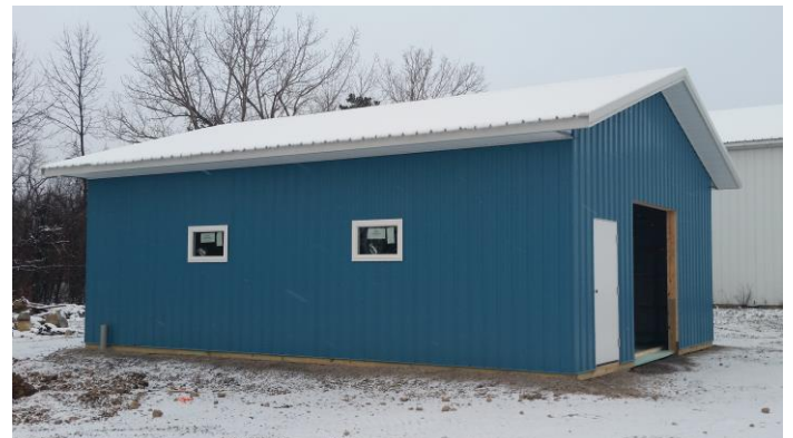
Swap Shop on Collett Road