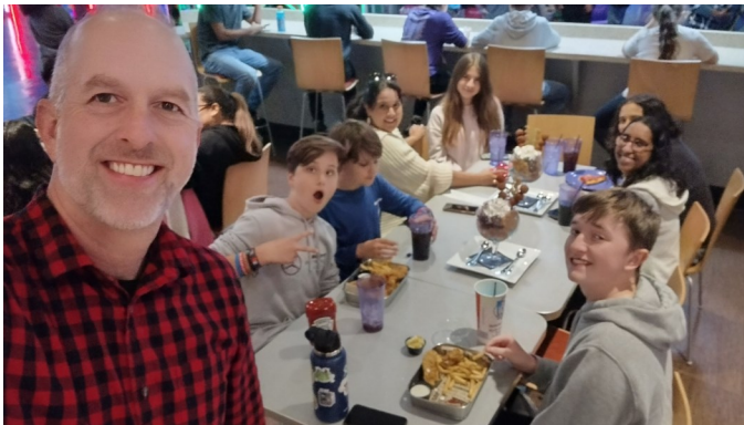
Youth Main Event Hangout - 3/19/23

April YOUTH Meetings: Sunday, Apr. 2 - Mission Project, 5--7pm. Sunday, Apr. 9 - No Youth Meeting - Easter Sunday. Sunday, Apr. 16 - Discussion & Games, 5--7pm. Sunday, Apr. 23 - MSR Carts, 4-7 p.m. Sunday, Apr. 30 - Hangout TBA. Join us and invite a friend or two!