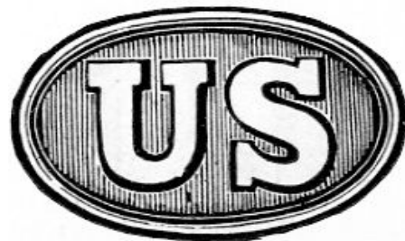
United States Civil War Soldiers' Belt Buckles; brass, lead backs; serviceable order; fine relic. Price, 75 cents each.

1,500 U. S. ARMY CIVIL WAR HATS, commonly called the "Jeff Davis Hat," adopted by Davis while Secretary of War in President Pierce's Cabinet; used by both North and South during the early years of Civil War; new goods, made during Civil War, slightly faded from age; black, stiff felt, with worsted hat cord in either yellow, red or blue, $1.50. Trimmings as in illustration.