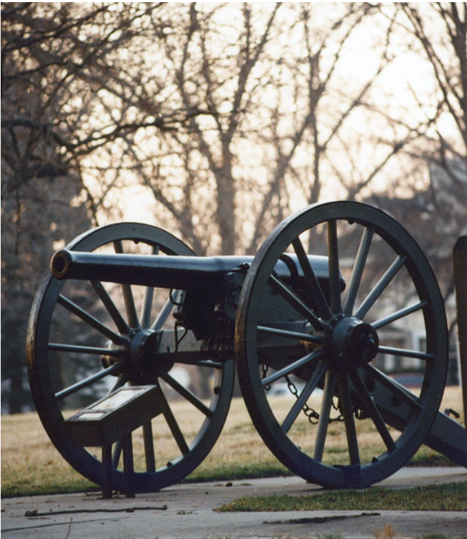
10-Pounder Parrott Rifle, Loose Park

This artillery piece was developed in France in the 1850's and was named for Emperor Napoleon III. It was designed to fire shot, shell, case shot, and canister. It was called the "workhorse" of Civil War artillery, and used for long-range dueling and against onrushing infantry. General Robert E. Lee wrote to the Confederate Secretary of War, "the best guns for field