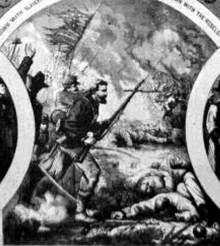
THE VETERAN'S VOTE.