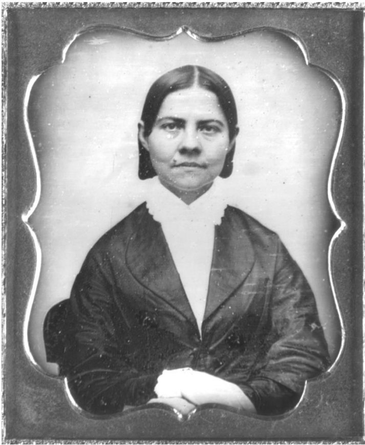
Lucy Stone (1818-1893) was an early advocate of antislavery and women's rights.