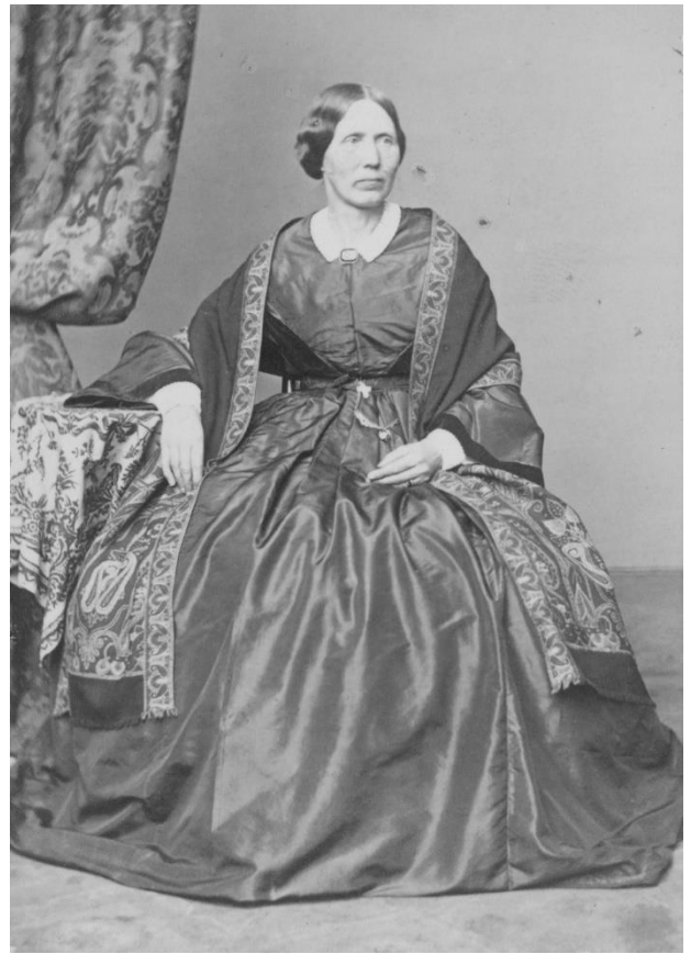
Unidentified woman in shawl, possibly a nurse, during the Civil War

Civil War Round Table of Kansas City P.O. Box 6202 Shawnee Mission, Kansas 66206-0202