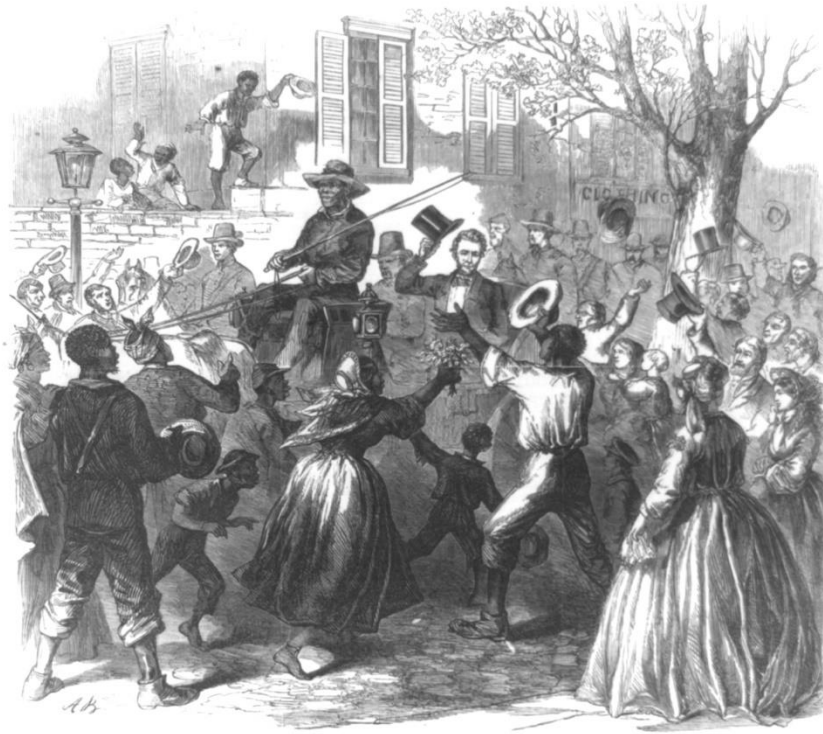
President Abraham Lincoln riding through Richmond, Virginia on April 4, 1865.

Civil War Round Table of Kansas City P.O. Box 6202 Shawnee Mission, Kansas 66206-0202