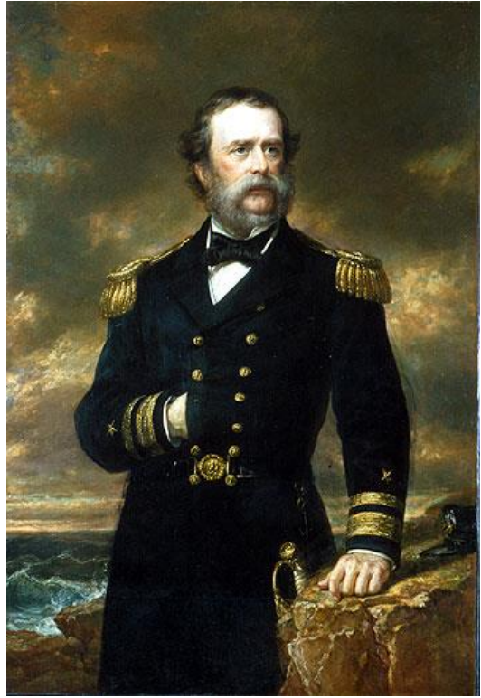
Rear Admiral Samuel Francis DuPont

Civil War Round Table of Kansas City P.O. Box 6202 Shawnee Mission, Kansas 66206-0202