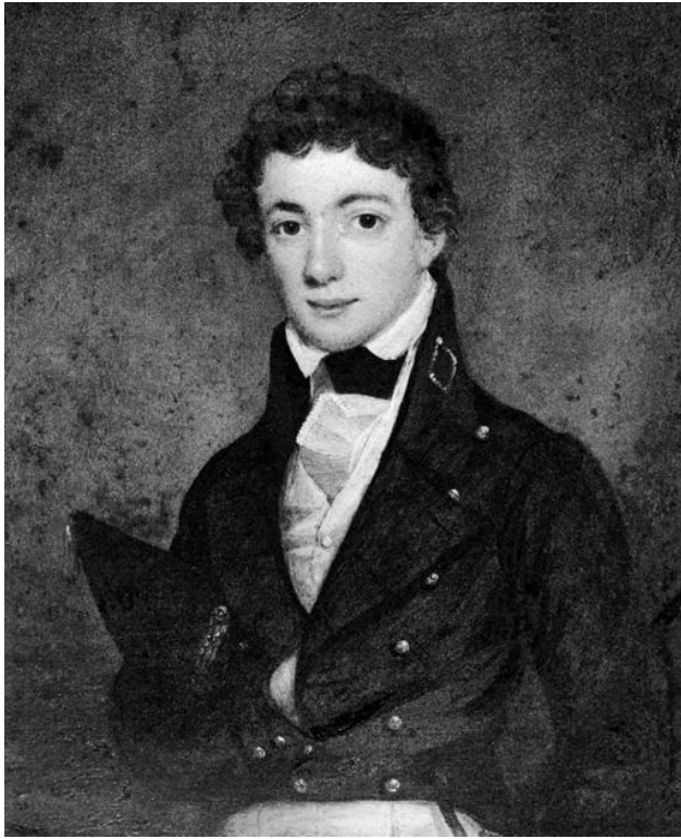
Midshipman Samuel Francis DuPont