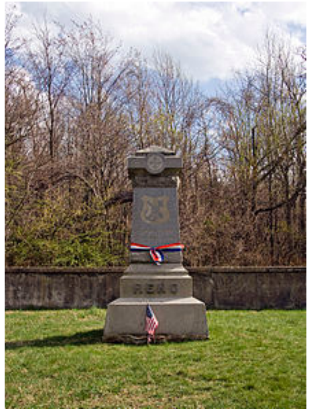
Reno Monument at Fox's Gap, South Mountain Battlefield

Known as a "soldier's soldier" who fought alongside his men, General Reno was killed while commanding a corps at Fox's Gap during the Battle of South Mountain on September 14, 1862 (photos and text courtesy of Wikipedia).