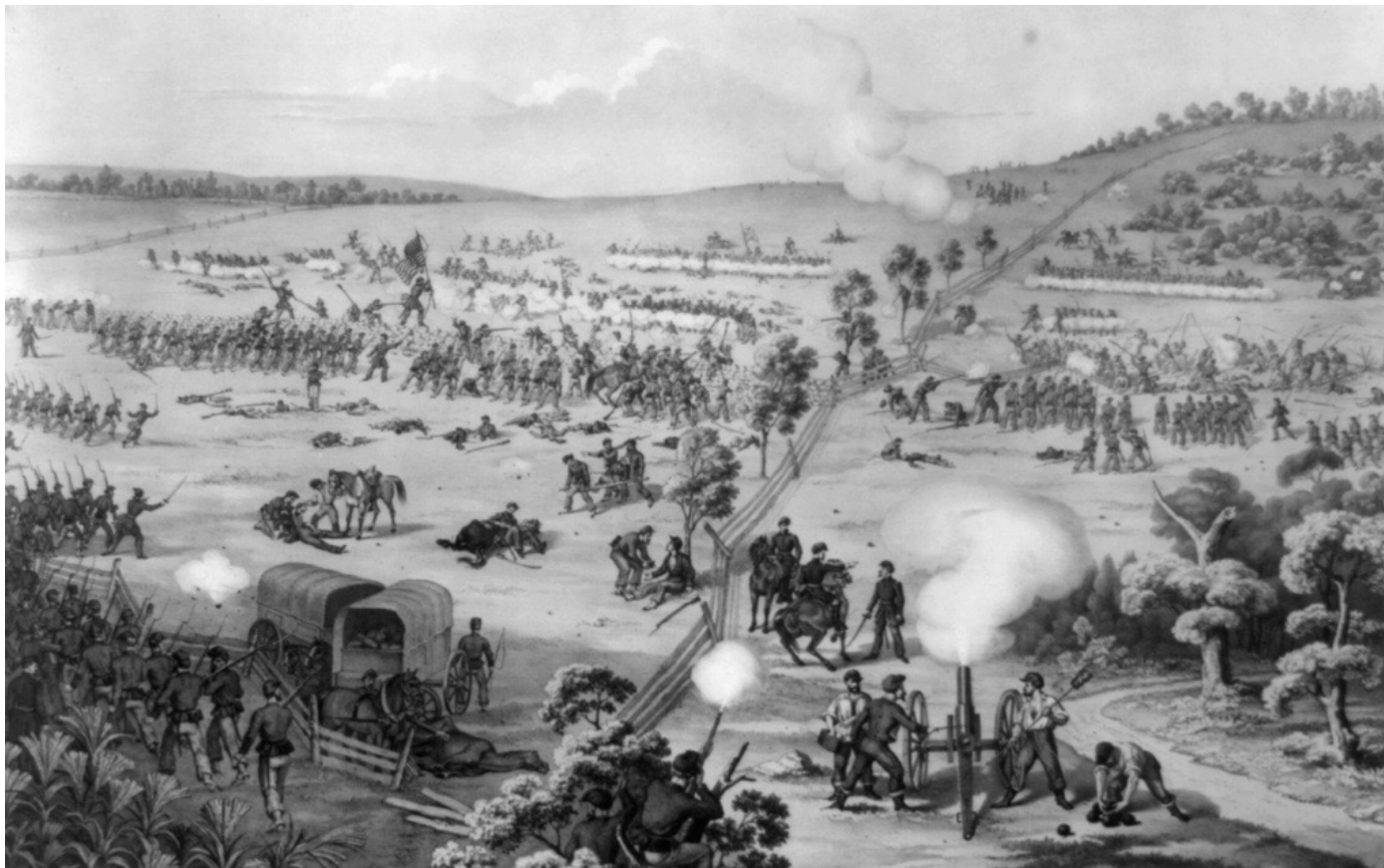
Fox's Gap at the Battle of South Mountain MD, September 14, 1862

Civil War Round Table of Kansas City P.O. Box 6202 Shawnee Mission, Kansas 66206-0202