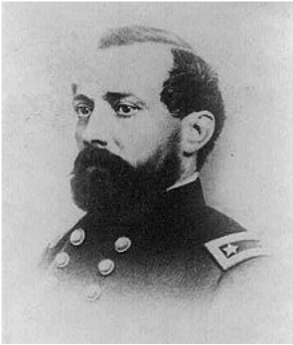
Union Major General Jesse L. Reno

Known as a "soldier's soldier" who fought alongside his men, General Reno was killed while commanding a corps at Fox's Gap during the Battle of South Mountain on September 14, 1862 (photos and text courtesy of Wikipedia).