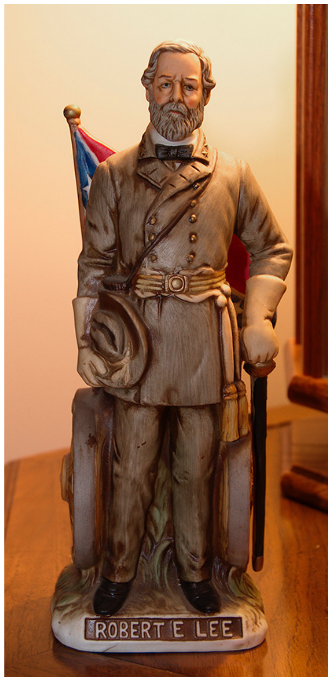
General Robert E. Lee Decanter

E. Lee and is still in its original packaging. It is beautifully hand-painted. It is just a bottle. There is no liquid inside of it. Due to dry rot of the cork, the cork has been removed and the head has been attached to the body with hot glue to prevent damage to the head piece. The head piece can easily be removed and a new cork installed, if so desired. The box is in good condition and has no rips or tears. The bottle is also in good condition. The bottle measures 12 inches tall. The box measures 6.5" wide, 5.5" deep, and 13.75" tall. Thanks for Looking!