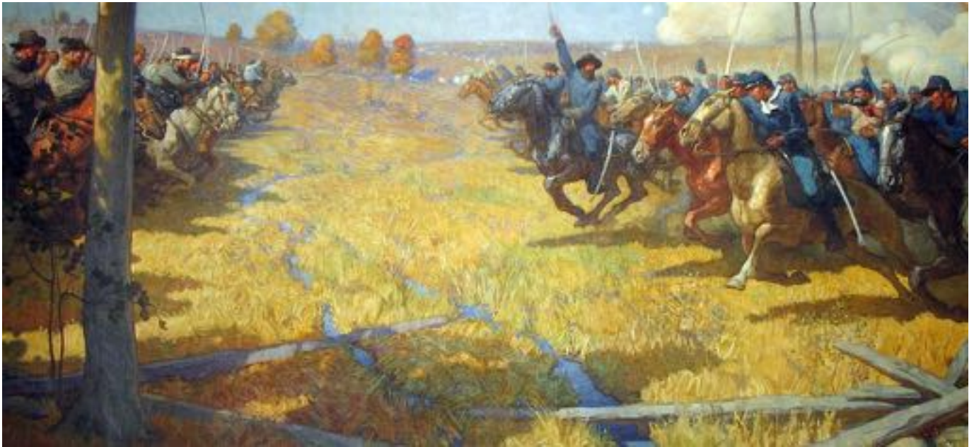
Mural of the Battle of Westport on Display at the Missouri State Capital. Painting by Newell Convers Wyeth.

Civil War Round Table of Kansas City P.O. Box 6202 Shawnee Mission, Kansas 66206-0202