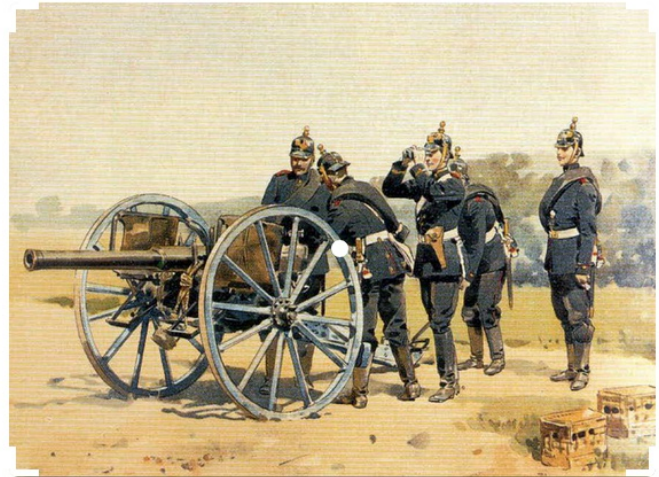
Prussian breech-loaded field artillery used during the Franco-Prussian War of 1870-1871.