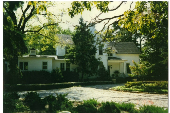
The Milburn-Foster House, built in the 1880's, is located at 67th and Antioch in Overland Park.