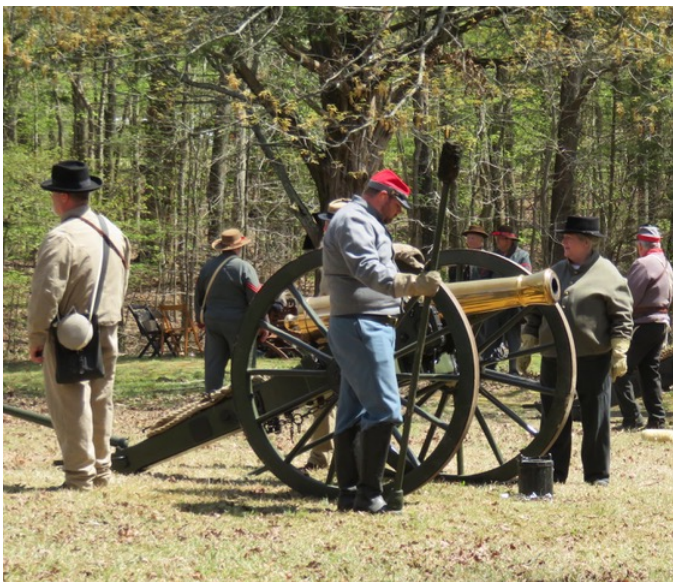
Artillery demonstration at Shiloh National Military Park, April 2019. This cannon is a smoothbore, bronze, 6-pounder field gun, Model 1841.