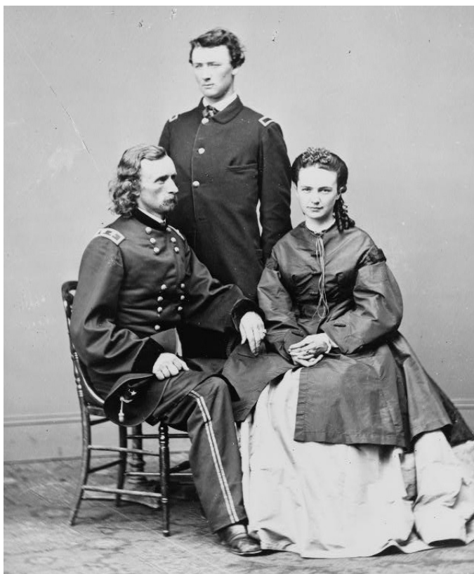
1864 photo of George Armstrong Custer, in uniform, seated with his wife, Elizabeth "Libbie" Bacon Custer, and his brother Thomas Ward Custer standing.