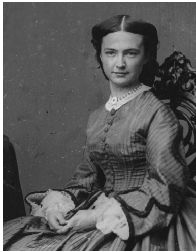
Elizabeth Bacon Custer