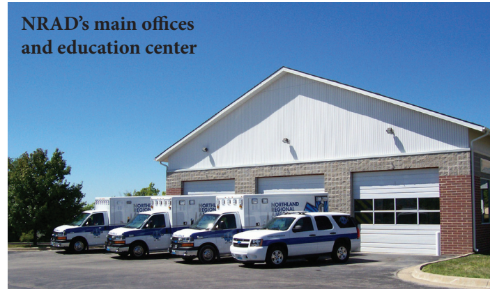
NRAD's main offices and education center

The Northland Regional Ambulance District Headquarters and Education Center are in Platte City, Mo. NRAD has Advanced Life Support Ambulances stationed in the northern, eastern and western trisections of the district. A paramedic supervisor, based in Platte City, is available district-wide whenever needed. These locations have been carefully and strategically selected to provide easy access to main roadways, ensuring the most efficient and timely response to every call for service received in our district.