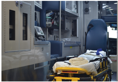
Our Advanced Life Support ambulances utilize state-of-the art equipment.

NRAD's crew members are highly-trained in providing emergency medical care to those who become ill or injured.