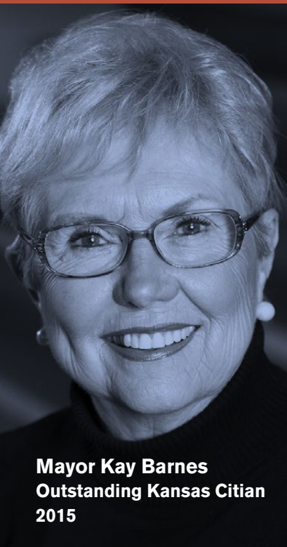
Mayor Kay Barnes Outstanding Kansas Citian 2015

Dedicated to the recognition, preservation and restoration of greater Kansas City's unique heritage.