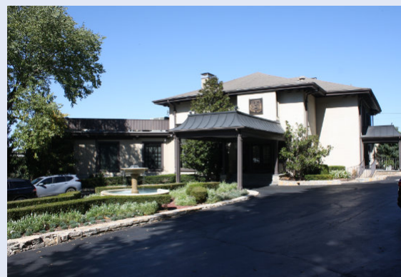
The Carriage Club 5301 State Line Road Kansas City, MO 64112

Hope to see you at our Annual Board Meeting!