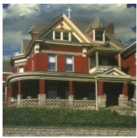
The building that houses the Strawberry Hill Museum was originally built in 1887.

By 1931, the orphanage was caring for 68 children. In 1940, the orphanage