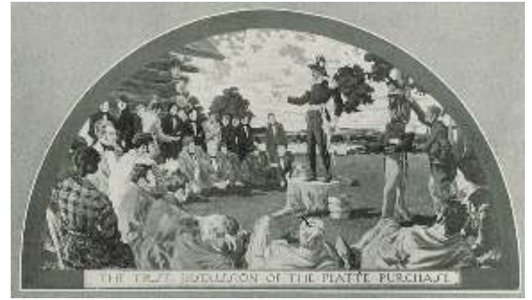
A black and white print of the color lunette in the Missouri State Capitol depicting the meeting in Liberty, Missouri, that initiated the final drive by local citizens to force the national government to extend Missouri's western boundary to include what we now refer to as the Platte Purchase.