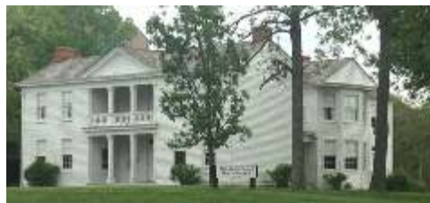
Alexander Majors Historic House and Museum