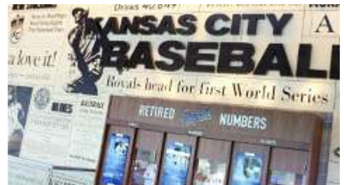
Image of exhibit at the Kansas City Royals Hall of Fame from its website.

A date has not been confirmed as yet, but we are still planning a tour of Kauffman Stadium in late June or July. This will be an exclusive tour for our group by the Royals management. (As you know, George Brett is our Outstanding Kansas Citian this year. Mark your calendars for November 6, Wednesday evening for this very special OKC event.)