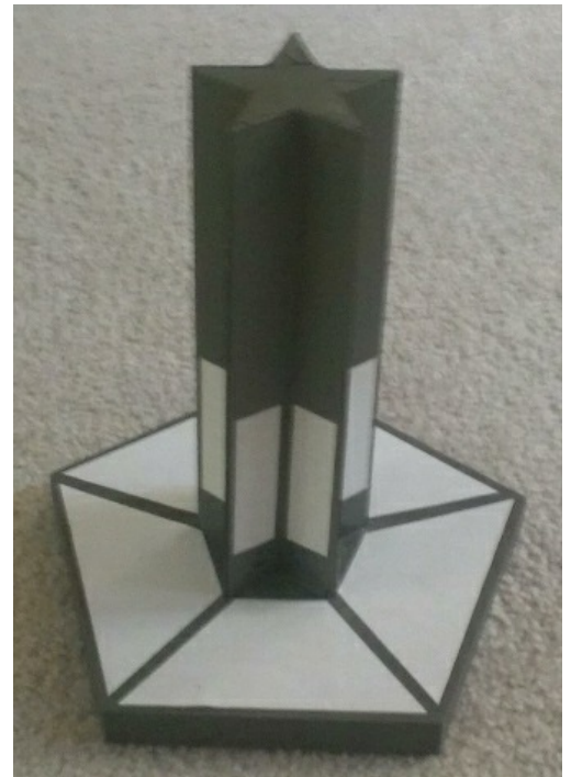
Model of the proposed NSDKC Pinnacle monument being developed by the Monument Committee.

Planned funding for the proposed project would be through grants, donations, and purchases of sponsored bricks at the base of the monument. The City of Kansas City, Missouri, Parks and Recreation has provided tentative approval to donate the grounds where the monument is to be located.