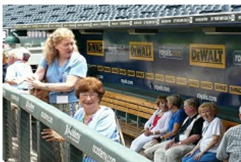
Members of NSDKC in the dugout during the tour of the Royal's Kauffman Stadium. Additional pictures from the tour can be viewed at http://nsdkc.org/photo_gallery .