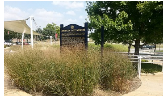
The American Jazz Museum marker has been installed and a dedication program will be announced later this year.