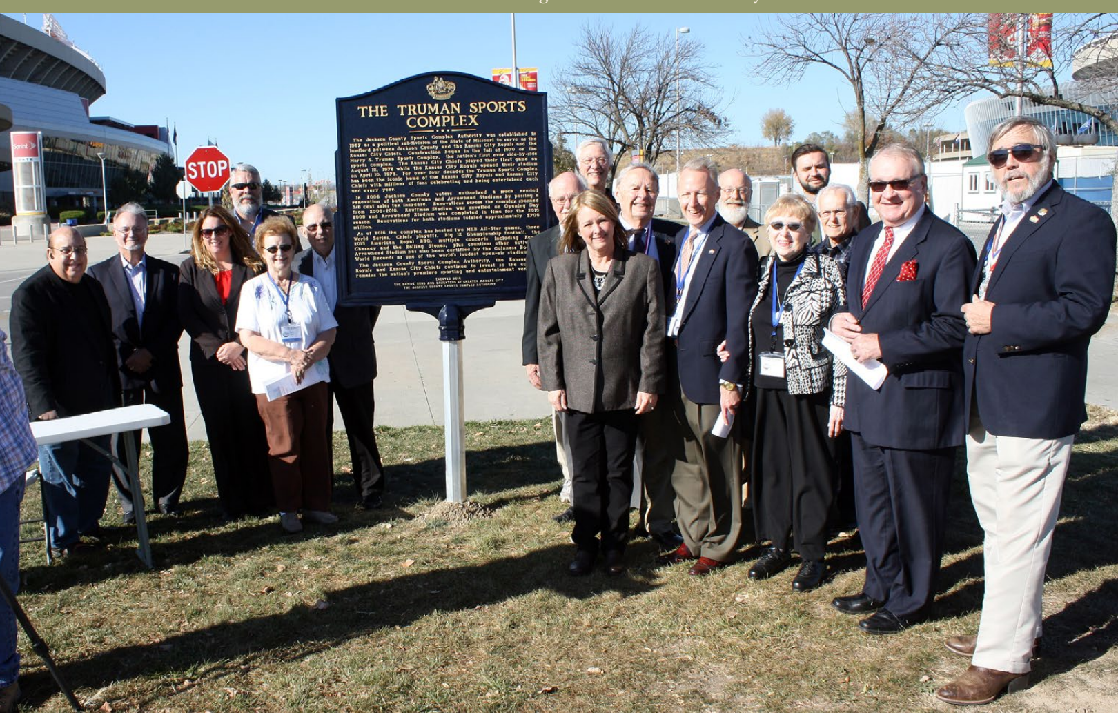
OKC16 continued from page 1

appropriate and needful. It describes the uniqueness of our complex because it was the first side-by-side baseball and football stadiums built in the nation. Prior to its completion in 1973, cities had built single stadiums that could be used for both sports, but with difficulty. But Kansas City did it right!