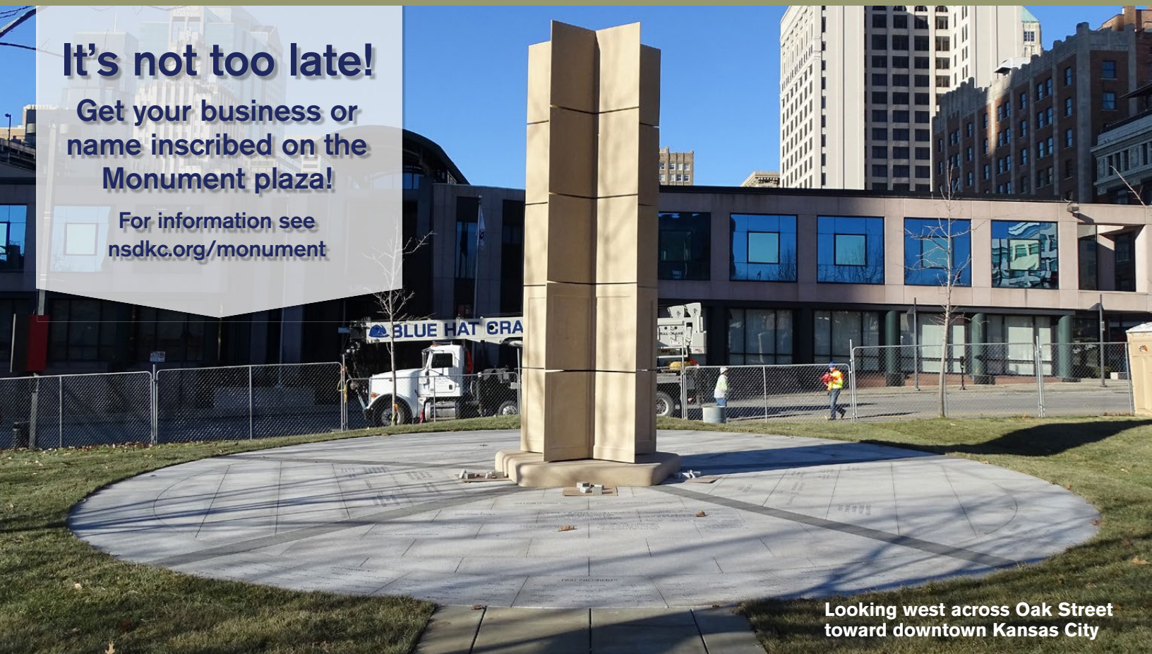
Looking west across Oak Street toward downtown Kansas City