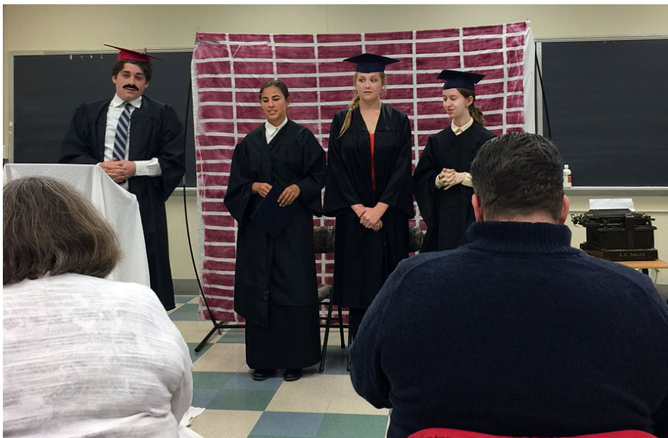
The Missouri contestants for the NSDKC history award.