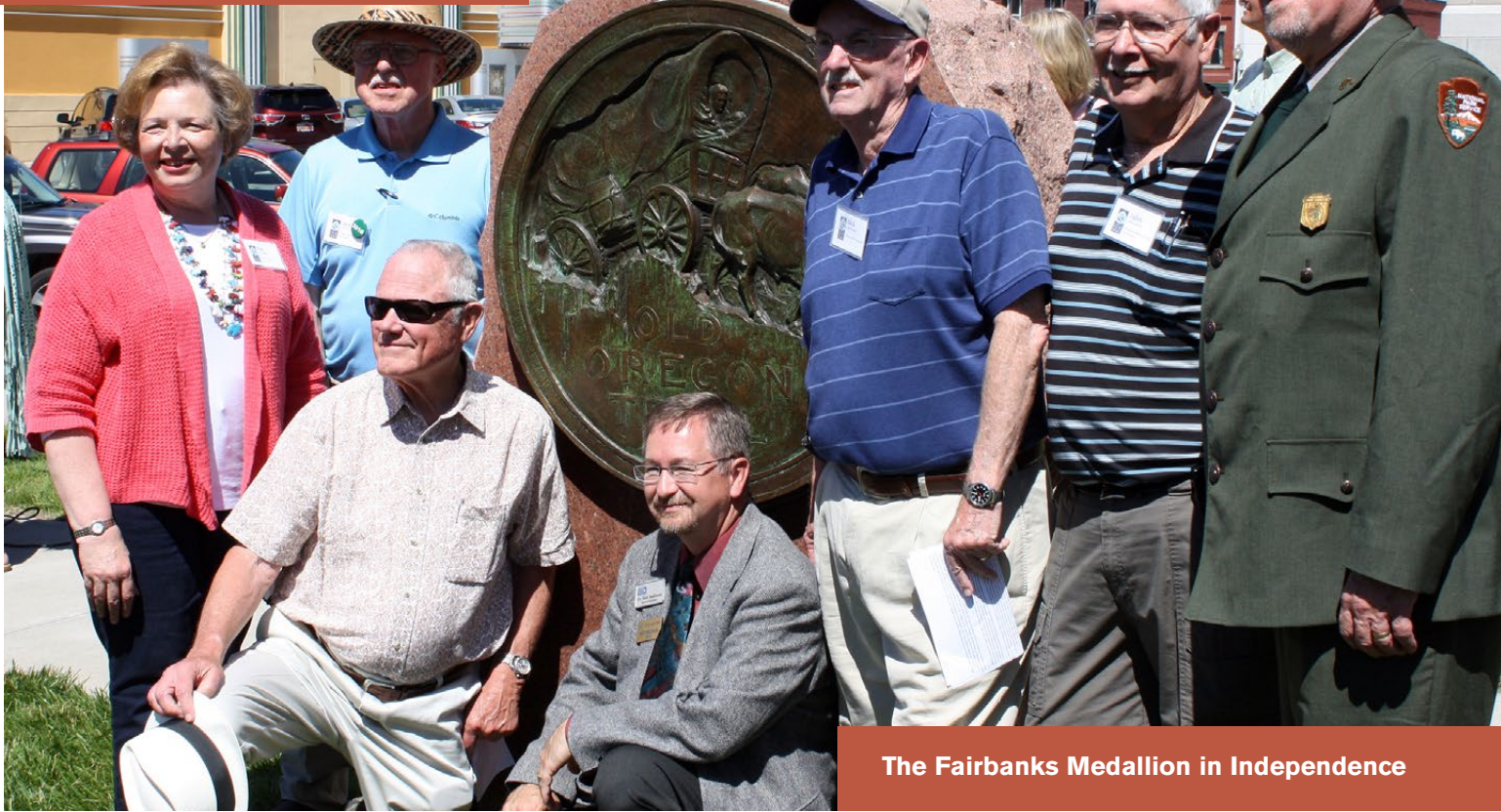
The Fairbanks Medallion in Independence

One of the key historical legacies of the Kansas City area continues to be our National Historic Trails and we are an important national focal point.