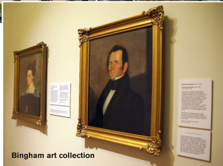
Bingham art collection

The tour included the hearing room used by Mr. Truman when he presided over the County Court and was responsible for managing the affairs of Jackson County. Members also enjoyed access to the Brady Courtroom with its elegant