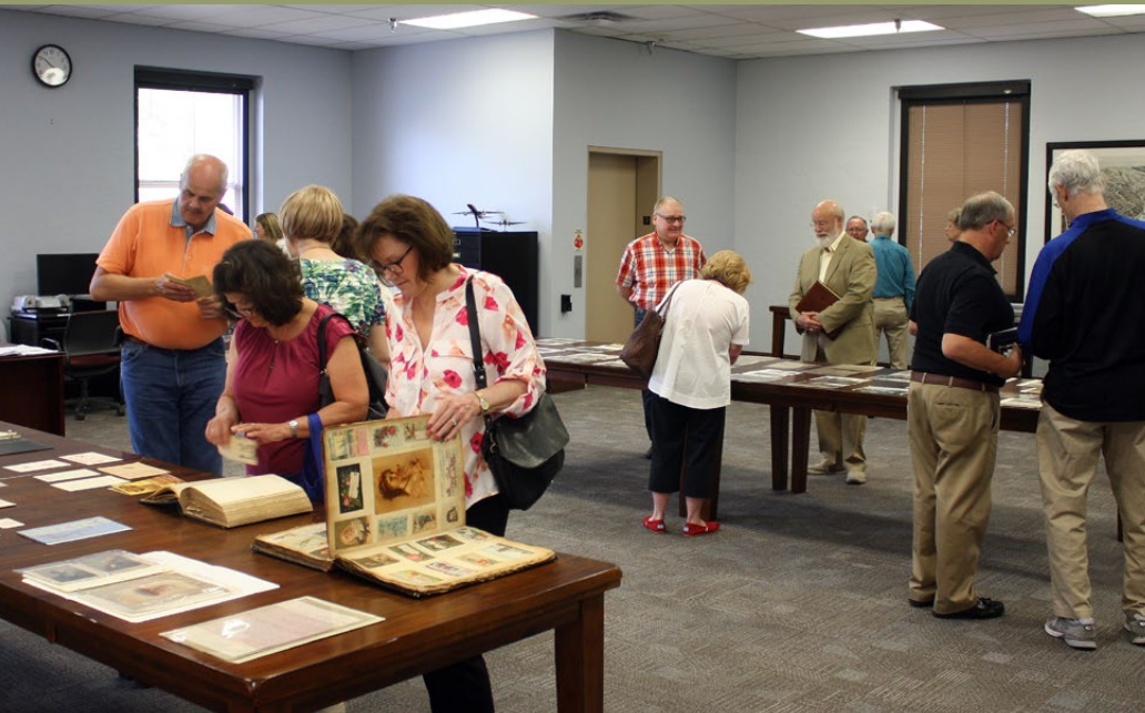
Several tables of our manuscripts