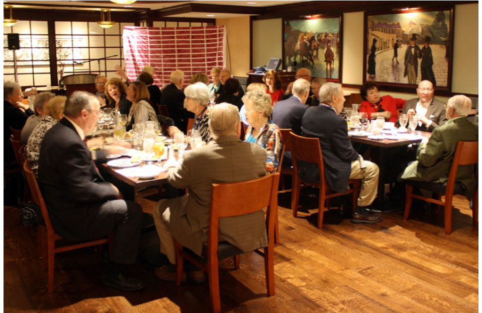
Members and guests had a tasty dinner and good time.