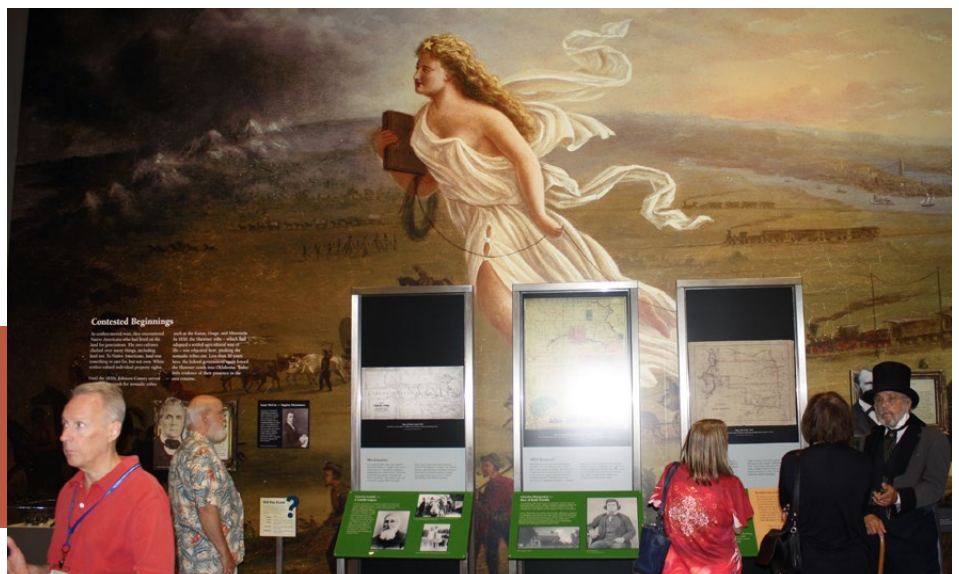
"American Progress" mural visualizing the idea of Manifest Destiny in settling the West