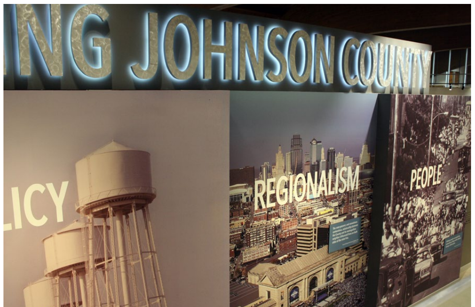
"Becoming Johnson County" theme mural