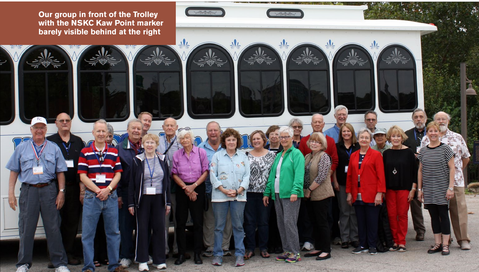
Our group in front of the Trolley with the NSKC Kaw Point marker barely visible behind at the right