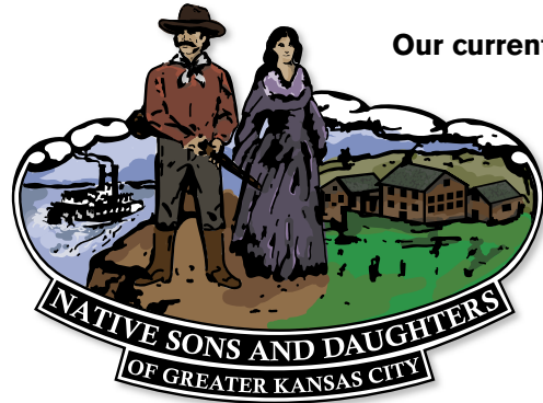
Our current logo

At 11:30, we returned to the Jack Stack Restaurant in the Freight House area. Your editor had the privilege of leading this tour with a group of NSDKC members and guests that were fun to be with.