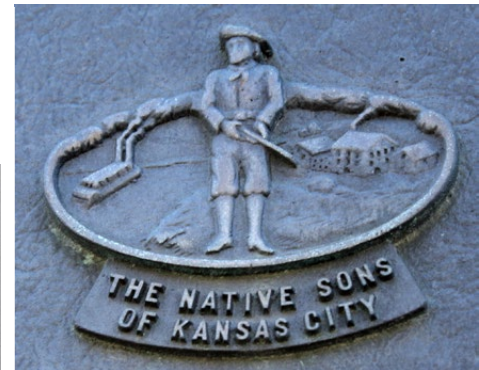
Two styles of logos on our earlier markers