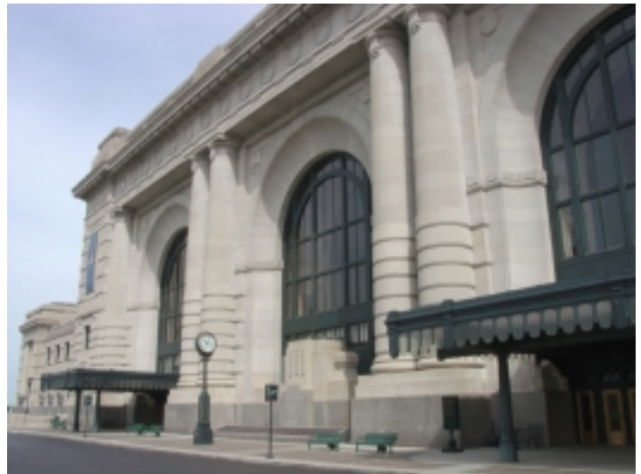
When originally constructed, Union Station was intended to have a statue placed on its pedestal (visible at bottom center) but one was never placed.