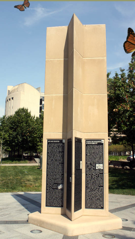
Looking north at our Monument with Federal Courthouse behind