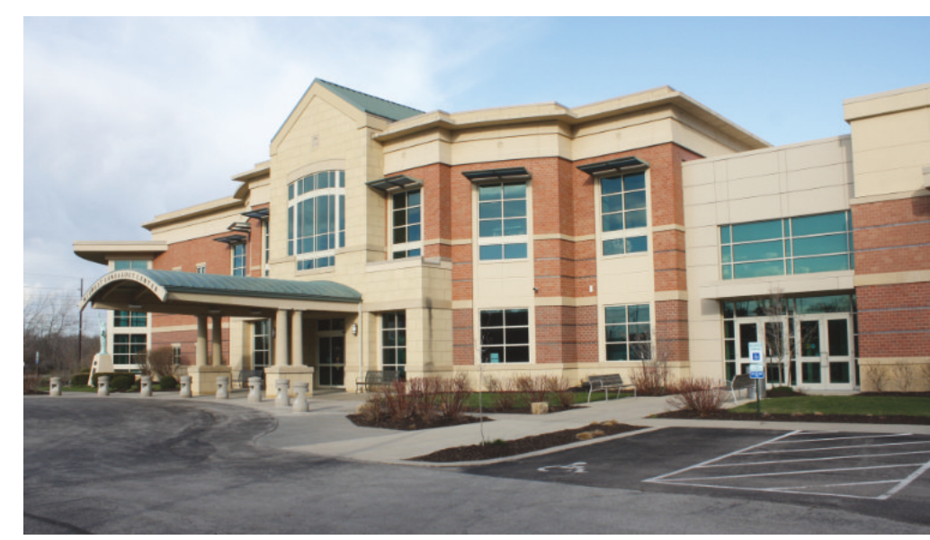
Midwest Genealogy Center (MGC)

Several of us declared that we would like to come back and examine it in detail. It is a very impressive Genealogy Center!