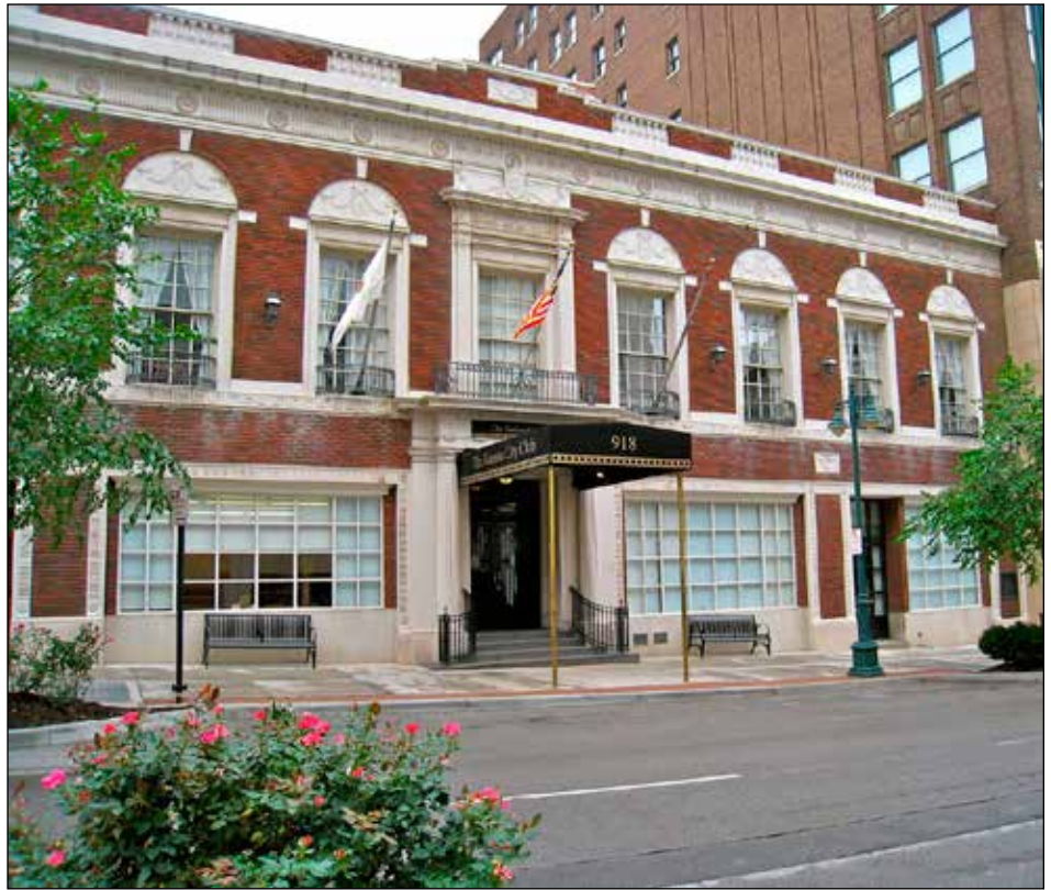
Kansas City Club is located at 918 Baltimore Avenue in downtown Kansas City.