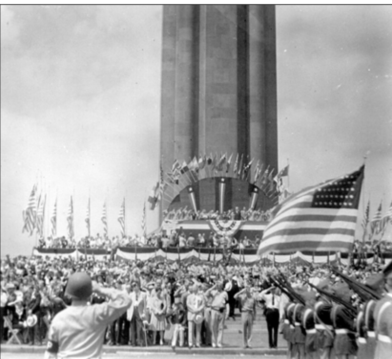
Tribute at the Liberty Memorial, Kansas City, 1940