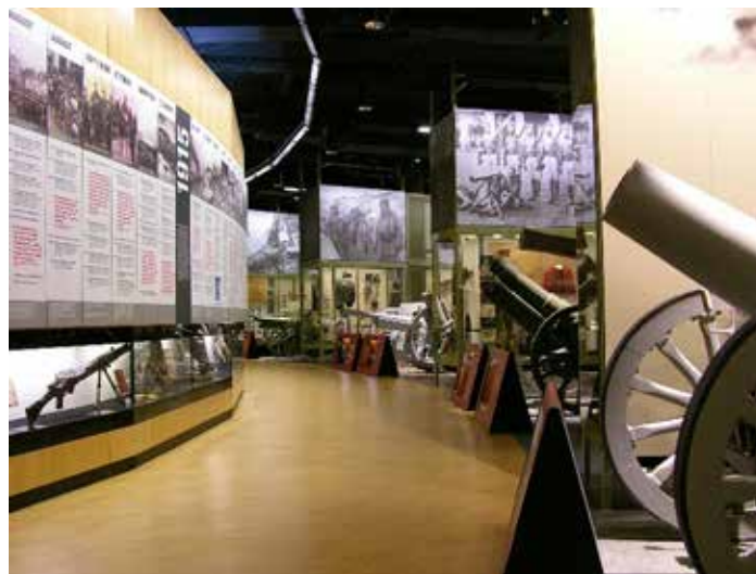
The National World War I Museum at Liberty Memorial is the only American museum solely dedicated to examining the personal experiences of a war whose impact still echoes in the world today.